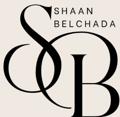
SB Monogram — Black

For dark backgrounds. Do not stretch, recolour or crop.