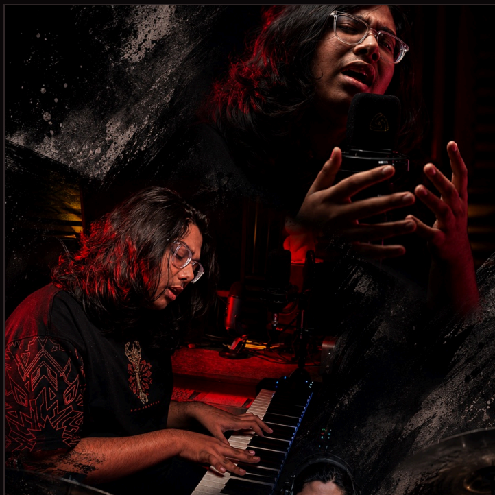
Studio Triptych — Press Photo