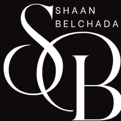
SB Monogram — White

Primary press photo: vocals, keys and drums in one frame. Approved for editorial use.